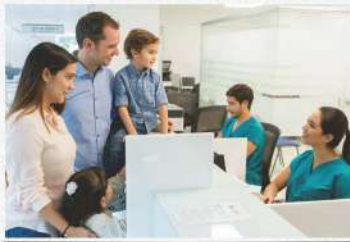
Patient Relationship Management