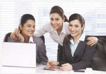
Human Resource Management for Hospital