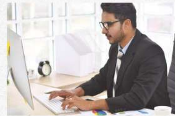
Documentation & Business Administration