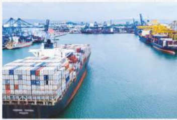
Fundamentals of Logistics & Supply Chain Management