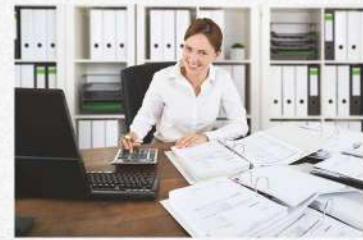
Import & Export and Customs Documentation