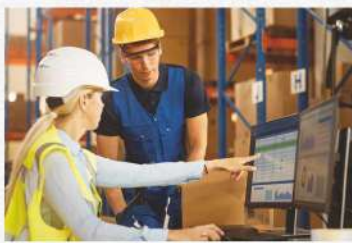
Material Handling, Packaging & Containerisation