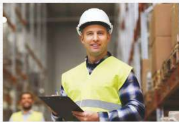
Warehouse, Inventory & Distribution Management