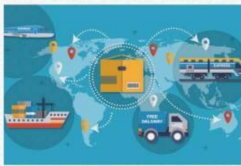
Logistics Operations & Supply Chain Management