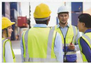
Dangerous Goods, Incoterms & Letter of Credit