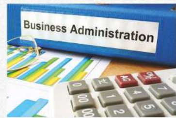
Advanced IT & Excel Training For Business Management