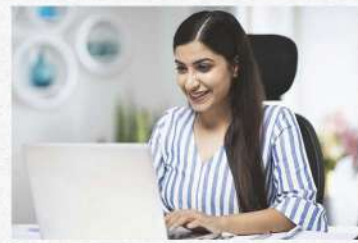
Material Management, Medical Records & Insurance