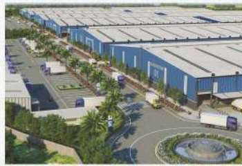
Warehouse Operations Distribution Management