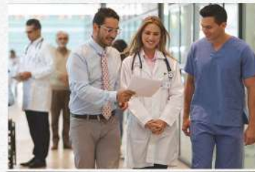
Hospital Organization Structure and Function