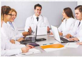
Management & Professional Business Skills