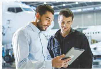
Marketing Management & Enterprise Resource Planning