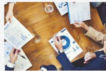
Customs Clearance & Import - Export Procedures