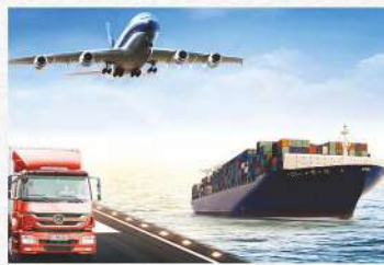
Shipping - Air Cargo & Transportation Management